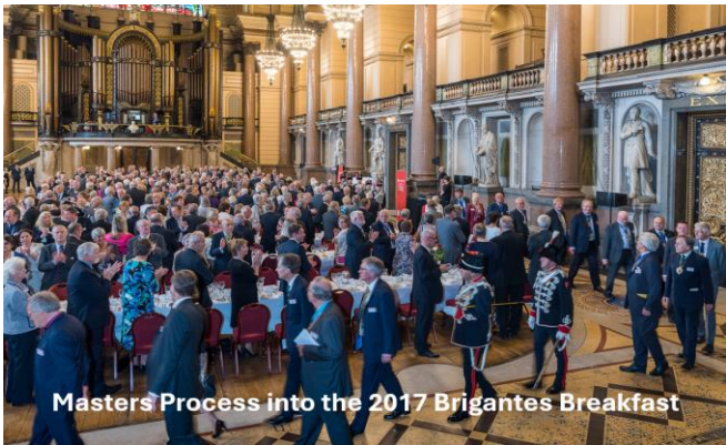
Masters Process into the 2017 Brigantes Breakfast

St George's Hall Liverpool Thursday 20 June