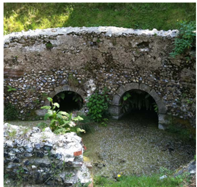
An early Conduit House

Early hydraulic engineering stands at the boundary of humans needs and the desire to harness the natural world yet set within a society of rich patronage and financial shareholding.