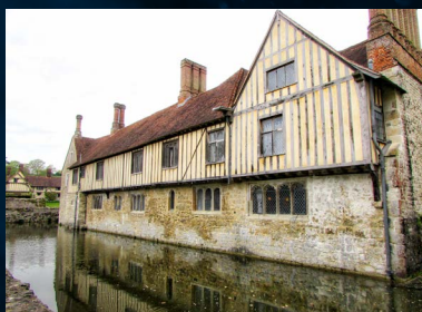
Ightham Mote, Kent